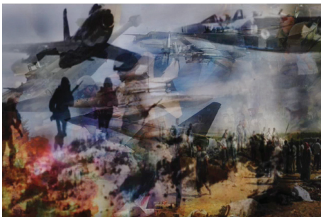
Media X Daily 1 March 2008