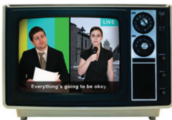
HOLD HANDS: COLLECTIVE